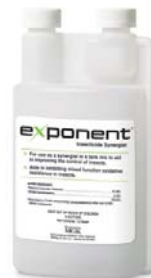
exponent Synergist Enhances efficacy, combats MFO resistance.