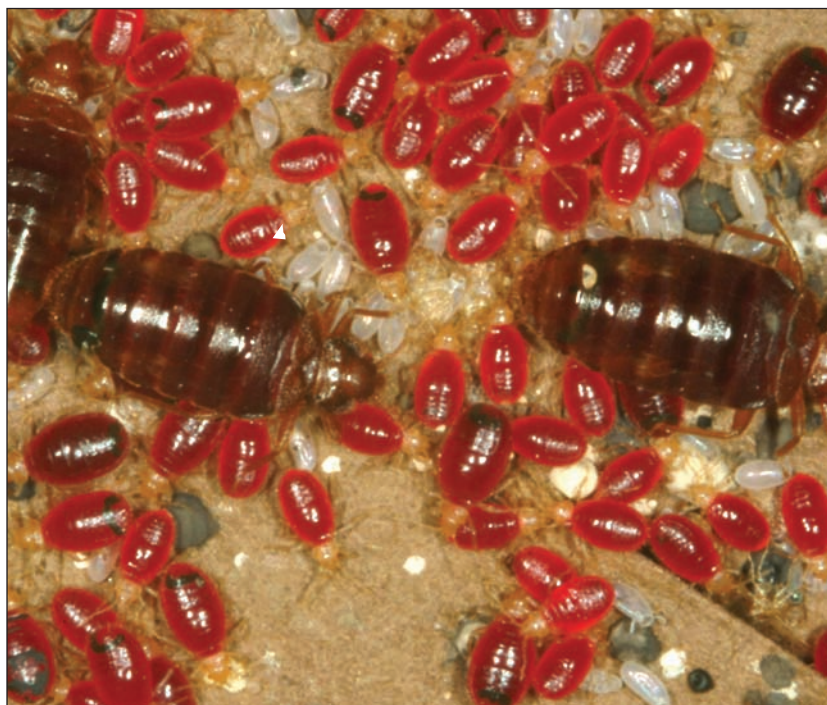
Adult bed bugs, young nymphs and eggs. Photo was taken just after feeding.