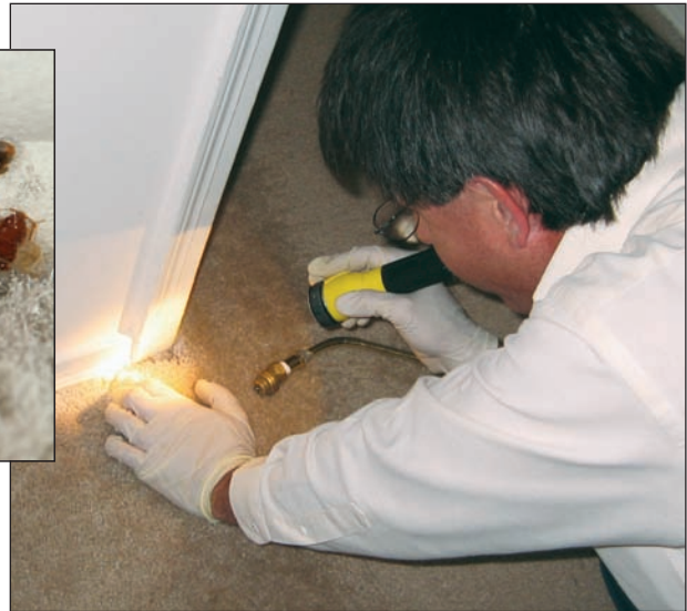
(Right) Bed bugs often hide along the edges of carpeting. A pest management professional performing an inspection. (Above) A close up of bed bug eggs, nymphs and adults.

While the aforementioned measures are helpful, insecticides are important for bed bug elimination. Professionals treat using a variety of low-odor sprays, dusts and aerosols. Baits designed to control ants and cockroaches are ineffective. Application entails treating all areas where the bugs are discovered or tend to crawl or hide. This may take hours of effort and follow-up visits are usually required.