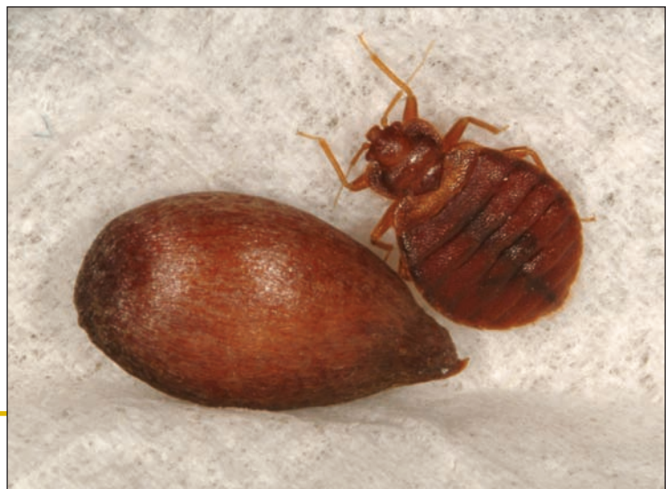
(Right) An adult bed bug is slightly smaller than an apple seed.

HOW INFESTATIONS BEGIN. It often seems that bed bugs arise from nowhere. The bugs are efficient hitchhikers