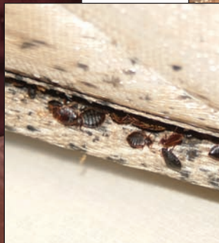
Bed bugs are often found within the seams, tufts and folds of couches, as well as on the underside of box springs and along the seams of mattresses. The blackish spots are excrement.